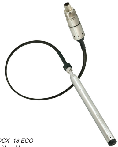
DCX-18 ECO with cable