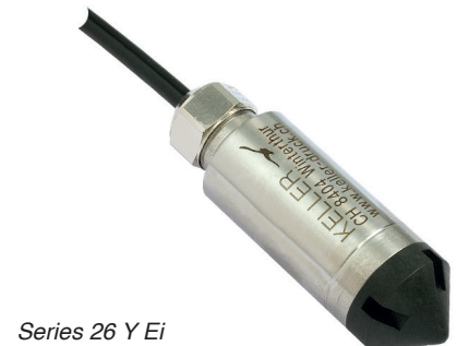
Series 26 Y Ei