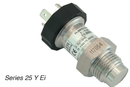
Series 25 Y Ei