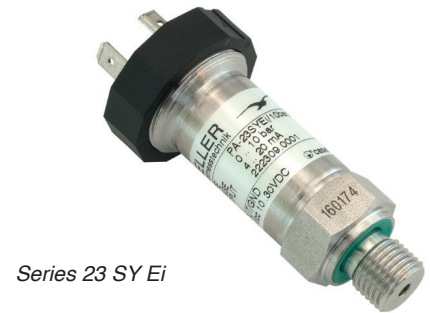
Series 23 SY Ei